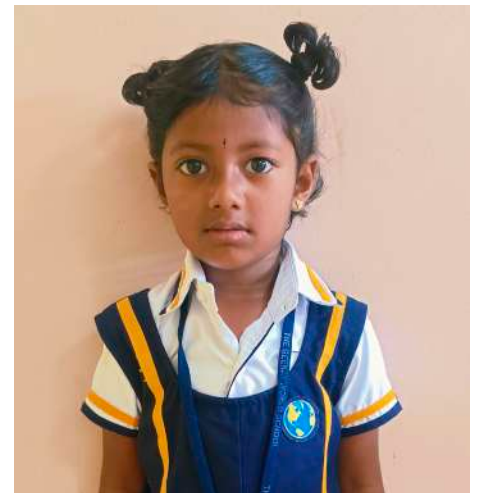
DITHYATHARA G - K2 LITCHI